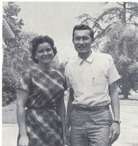
Ambassadors to Australia