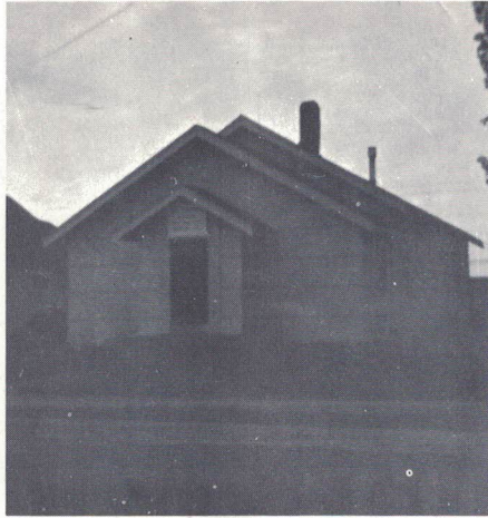
Old Church building at Eugene.